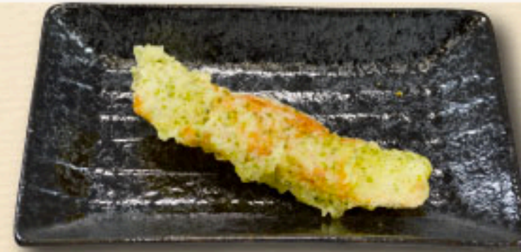
Chikuwa (Fish cake)