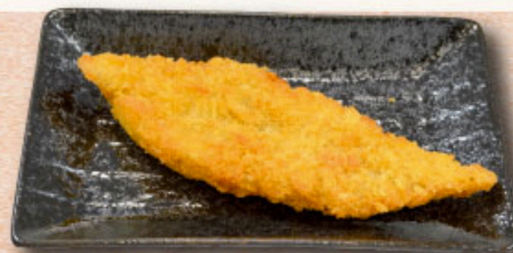
Fried Hoki (White fish)