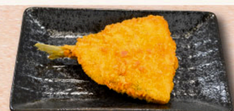
Fried Aji (Horse mackerel)