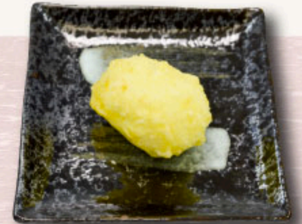
Egg (Hard boiled)